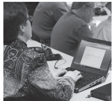
In class at LTSS.